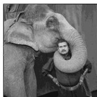
Mary Ellen Mark